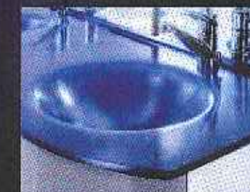
Polishing mineral materials