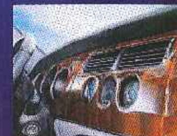
Buffing up curved components